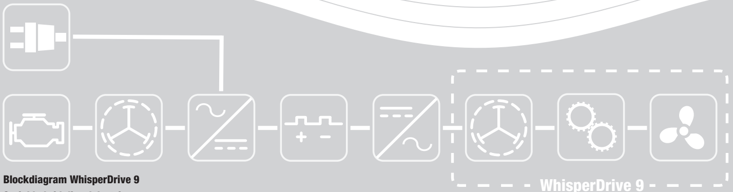
Blockdiagram WhisperDrive 9 Serial hybrid dieselelectric system